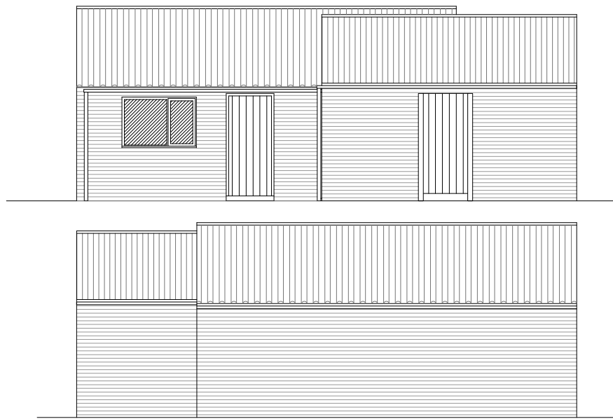
Proposed Elevations ( Home Brewery and Store ) 1:100