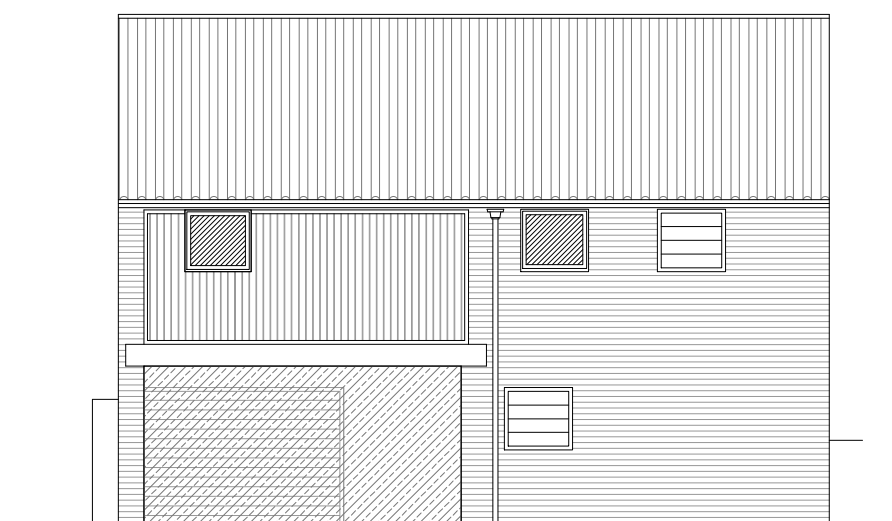
Proposed Side Elevation ( Ancillary Accommodation ) 1:100