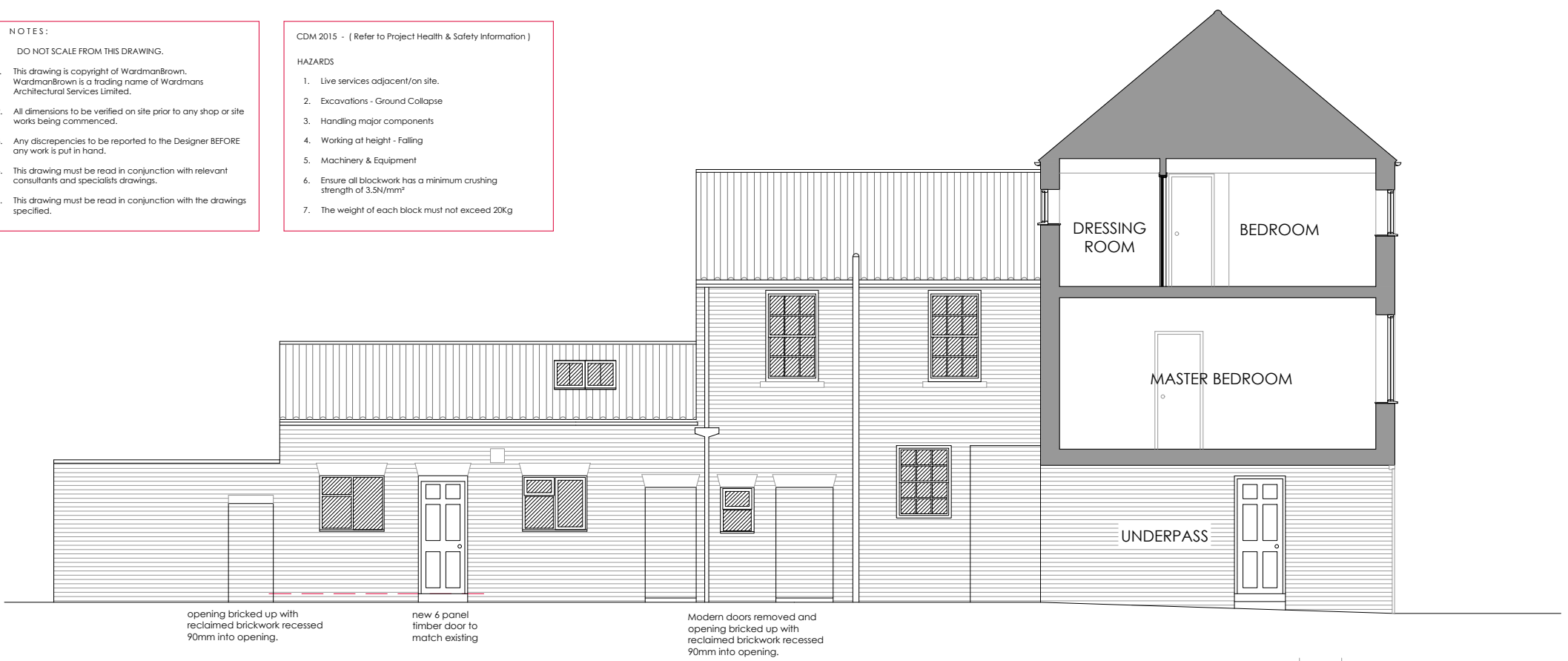
Proposed Side (South) Elevation 1:100

CDM 2015 - ( Refer to Project Health & Safety Information ) HAZARDS Live services adjacent/on site. Excavations - Ground Collapse Handling major components Working at height - Falling Machinery & Equipment Ensure all blockwork has a minimum crushing strength of 3.5N/mm 2 The weight of each block must not exceed 20Kg